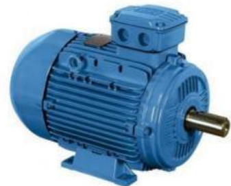
THREE PHASE INDUCTION MOTOR

B Write the name of the following tools & accessories