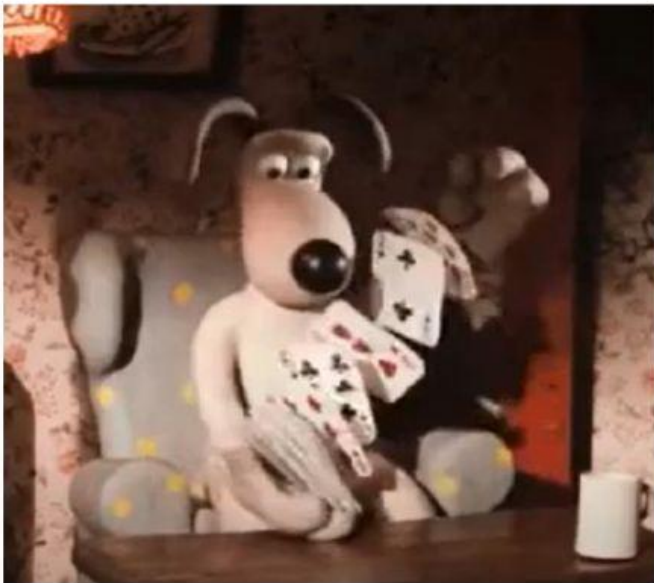
Gromit is playing cards.