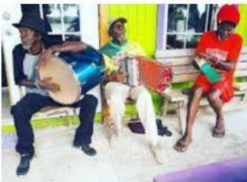
rake 'n' scrape

8. What type of music was played at the Regatta?