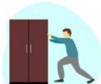
Pushing a big cabinet