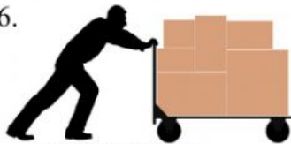
Pushing a big cart