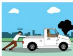
Pushing a pick-up car