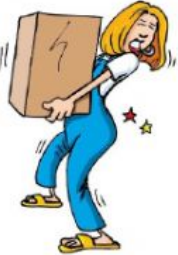
Lifting a big heavy box