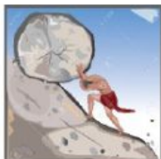
Pushing a big rock