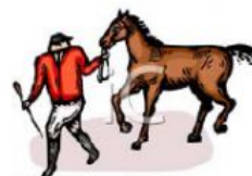
Pulling a horse