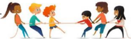
Playing tug of war