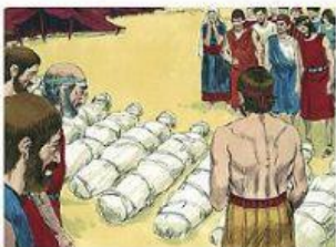
a. They die.

_____ 4. What did God do to those who did not believe and follow his command?