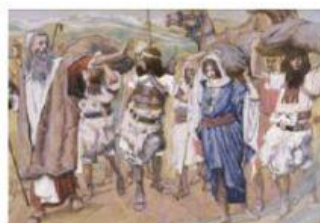
b. They were sent back to Egypt.