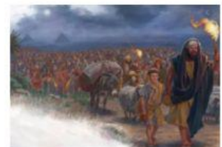
c. They went to Canaan.

_____ 5. How long did the Israelites wander in the wilderness as consequence to their disobedience?