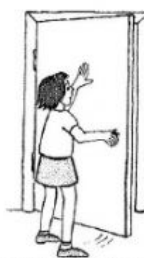
opening a door