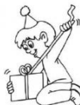
untying a bow