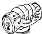
Squashing a tin can trolley

Push or pull? Write the actions in the correct columns.