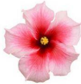
FLOWER / TREE