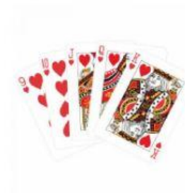
SKIRT / CARDS