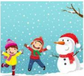
WINTER / SPRING