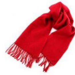
HAT / SCARF