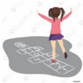
HIDE AND SEEK/ HOPSCOTCH