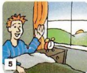
Joe _____ at 8:00.