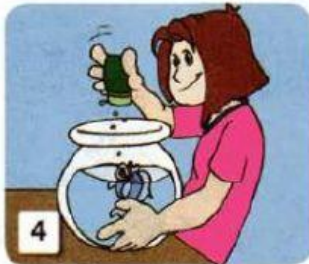
I _____ every day.