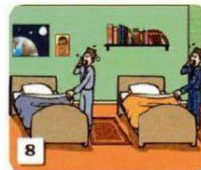
We _____ early on weekdays.