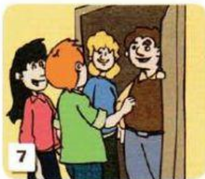
My parents _____ at the weekend.