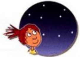
look at the stars