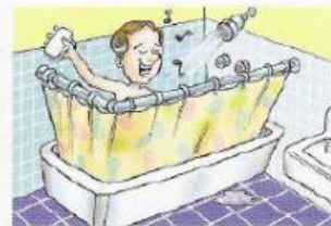
9. Marvin bathroom singing