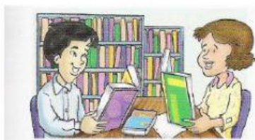
7. you library studying English