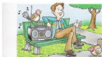
11. your friend park listening to music

https://www.youtube.com/watch?v=MP7sTLKZ03o