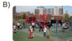
There are some children in the playground.