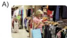
There is a hospital near the mosque.