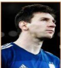
Lionel Messi - soccer player

I DON'T WANT OTHER PEOPLE TO DECIDE WHAT I AM. I WANT TO DECIDE THAT FOR MYSELF.