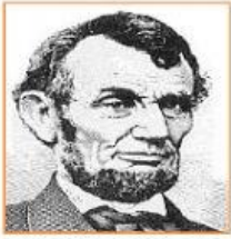
Abraham Lincoln - former US president

1. Match with lines the quotes with person who said it.