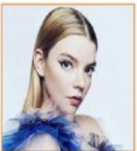
Anya Taylor-Joy - actress

"But if you judge a fish on its ability to climb a tree, it will live its whole life believing that it is stupid"