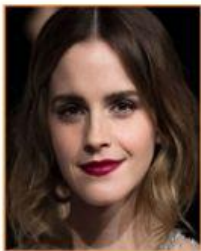
Emma Watson - actress

You cannot escape the responsibility of tomorrow by evading it today.