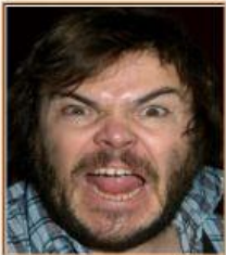
Jack Black - actor

You cannot escape the responsibility of tomorrow by evading it today.