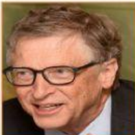
Bill Gates - creator of Microsoft

The greatest gift in life is the ability to think great thoughts and have the strength to take action so that those thoughts become reality in this wonderful and abundant world.