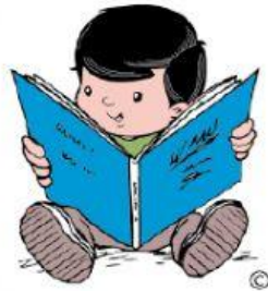
Write / Read