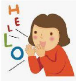
Listen / Speak

A: Click to Listen and choose the correct word.