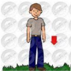
Hand up / Hand down