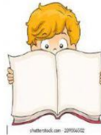
Open / Close