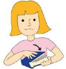
Open / Close