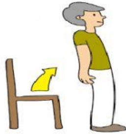
Sit down / Stand up