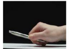
Put down / Pick up