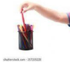
Put down / Pick up