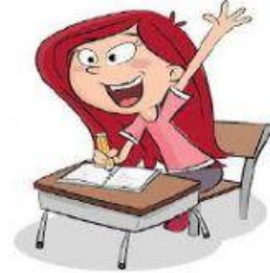
Hand down/ Hand up