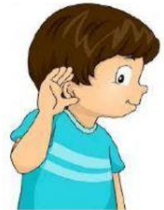
Speak / Listen