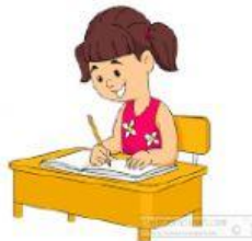
Read / Write