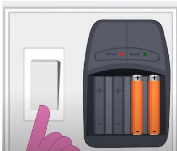
USE RECHARGEABLE BATTERIES