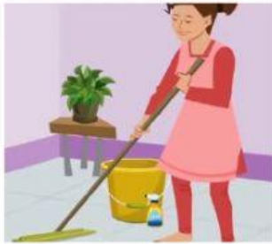
CLEANING THE HOUSE / COOKING

3)WATER CYCLE: Complete with the correct words