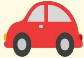
ball – car