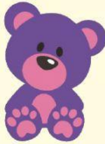
doll – teddy