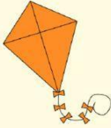
kite – train