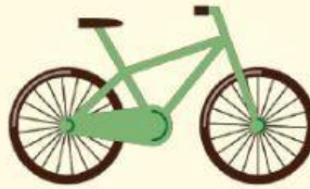
kite – bike