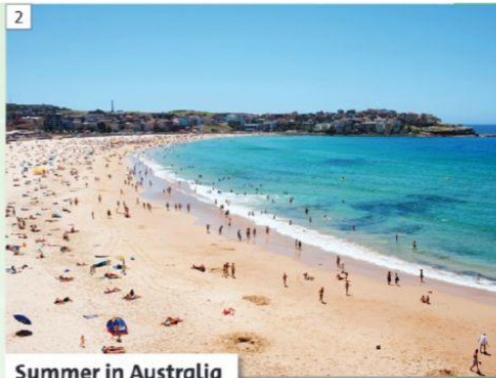
Summer in Australia

The autumn months in the USA are September, October and November. The nights get longer and the leaves turn orange, yellow and red.