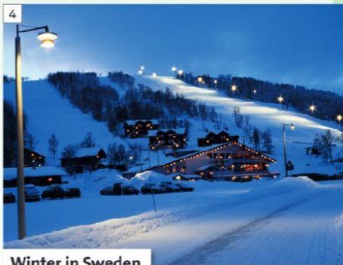
Winter in Sweden

When it's winter in the UK it's summer in Australia! Australian summers are very hot. Families go to the beach and lots of people swim in the sea.