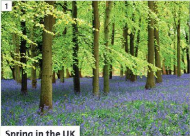
Spring in the UK

In the UK there are four seasons: spring, summer, autumn and winter, but seasons are different all around the world.