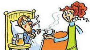
6 Mr Hardy / go / to work

1. the living room Did yesterday? Peter tidy