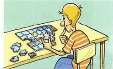
3 Jim / finish / his puzzle