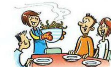
5 Beth / cook / spaghetti