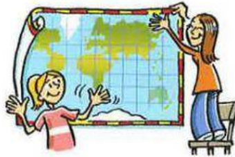
2 Sophie / help / her teacher