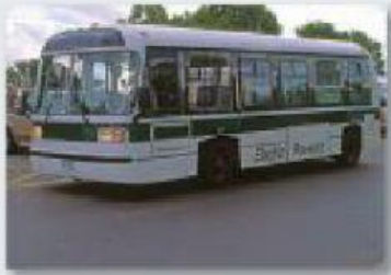
▲ Transportation on campus