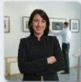
▲ A student art gallery